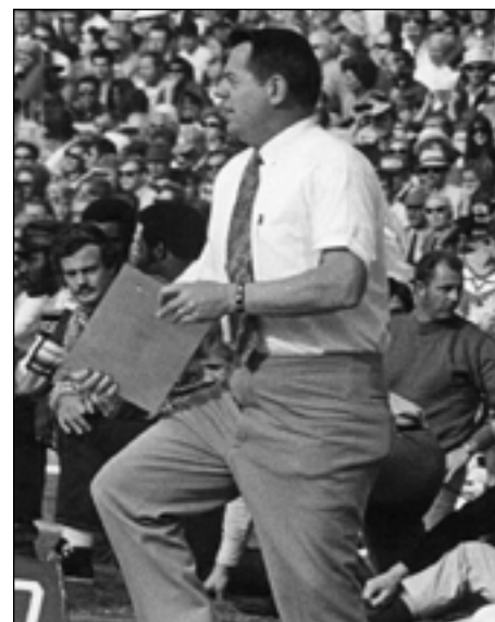
John Ralston coached Stanford to consecutive Rose Bowl victories in 1971 and '72.