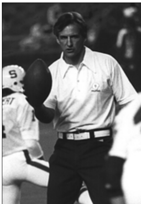
Former Stanford assistant coach George Seifert went on to win two Super Bowls as head coach of the 49ers.