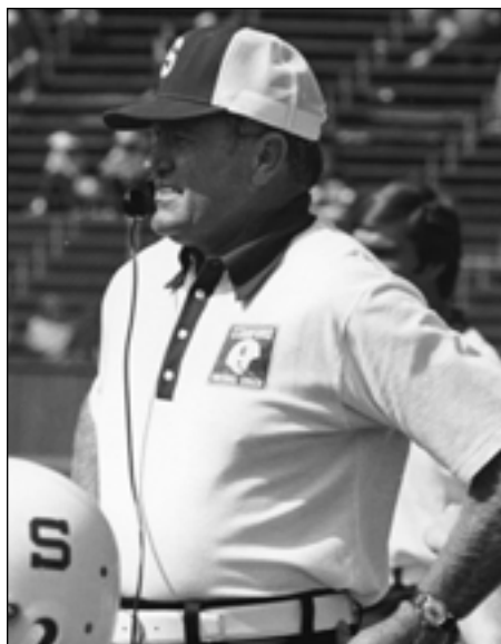
Jack Christiansen coached Stanford from 1972-76.