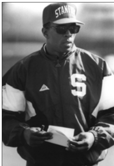
Former NFL All-Pro Keena Turner coached at Stanford from 1992-94 after playing on four Super Bowl champion teams with the San Francisco 49ers.