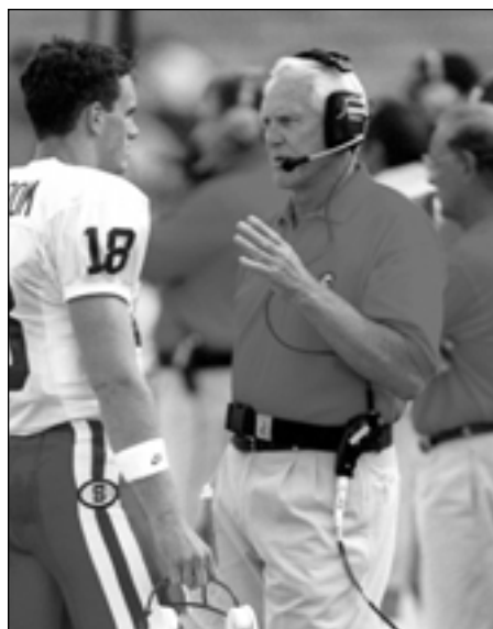
NFL Hall of Famer Bill Walsh led the Cardinal to Sun, Bluebonnet and Blockbuster Bowl victories as Stanford's head football coach.