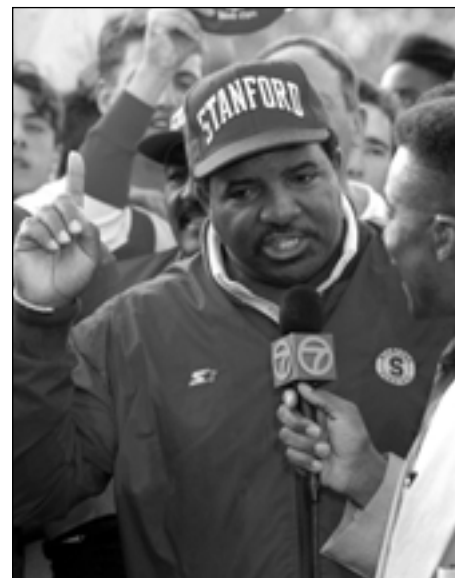
Denny Green coached Stanford to the 1991 Aloha Bowl