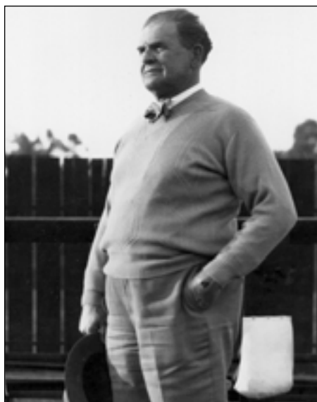
Glenn S. "Pop" Warner is generally regarded as one of the all-time great college coaches.