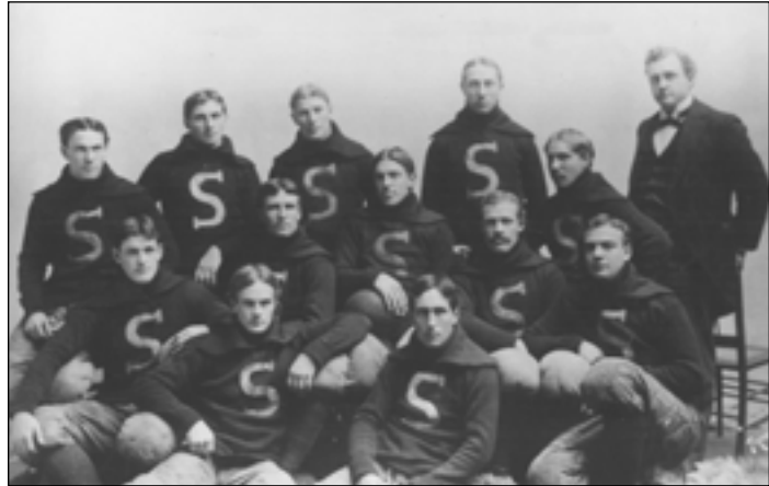
The 1895 Stanford football team finished 4-0-1.